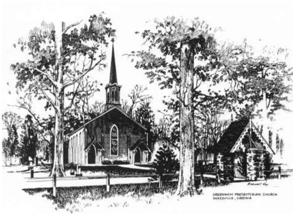
GREENWICH PRESBYTERIAN CHURCH NORFOLKVILLE, VIRGINIA